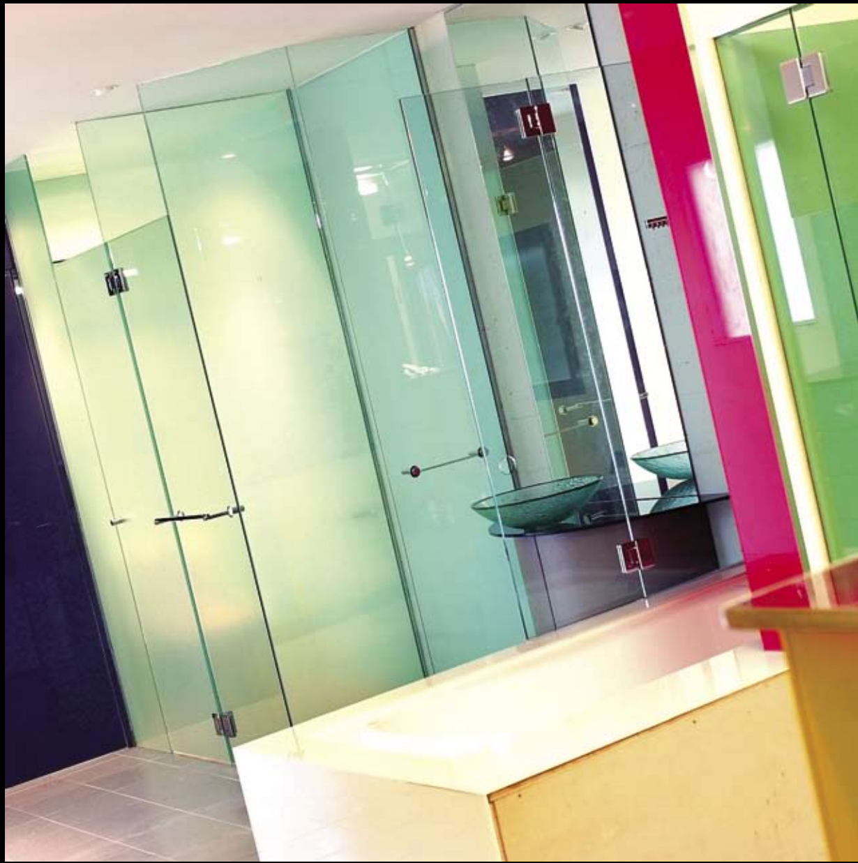
Shower enclosure, entry door, wall coverings and counter tops